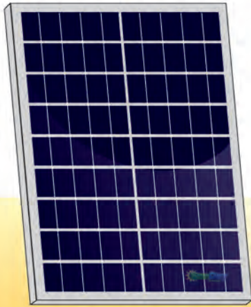
SOLAR MODULE: SDP-5